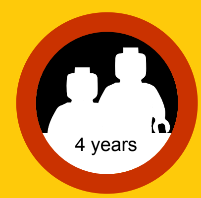
Guests must be at least 4 years old