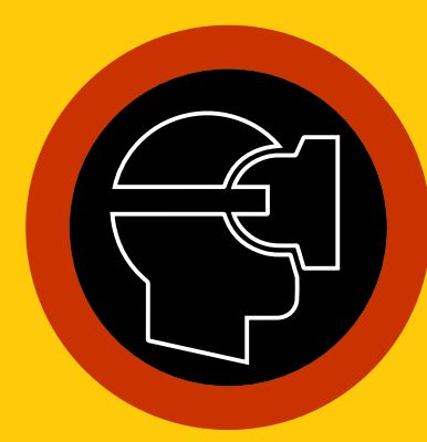
Should you feel dizzy, disorientated or ill during any part of the ride, remove the VR headset and wait until the ride has finished before dismounting