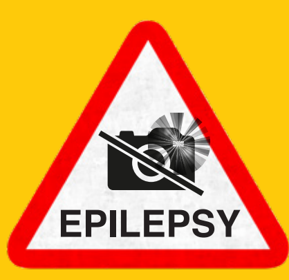
This ride is not recommended for guests who suffer from or have suffered from Photosensitive epilepsy