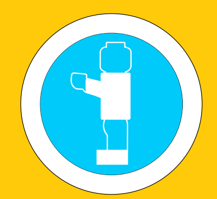
Shirts and shoes must be worn at all times