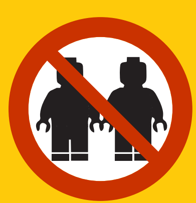
No standing at any time