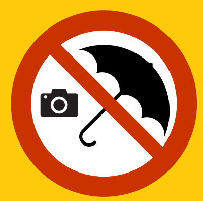
No Umbrellas, cameras, jewellery or loose items (Please tie long hair back)