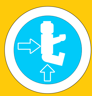
Upper & lower body control is required. Guests must be able to sit upright without assistance. Guests must be able to transfer to the to ride vehicle unaided or with the help of a carer