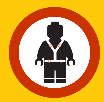
Do not remove the safety harness until the ride has stopped

Health, age, size and weight are important considerations. Please observe these warning and instruction signs. For more information, please ask a member of the team.