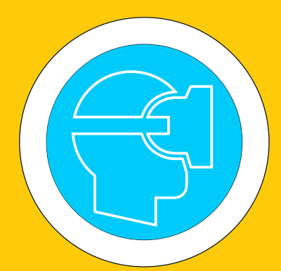
The VR Headset must fit securely without the use of hands