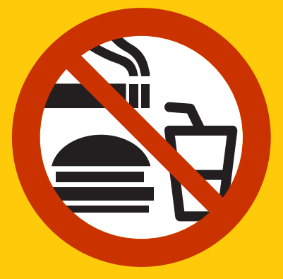
No eating, drinking or smoking